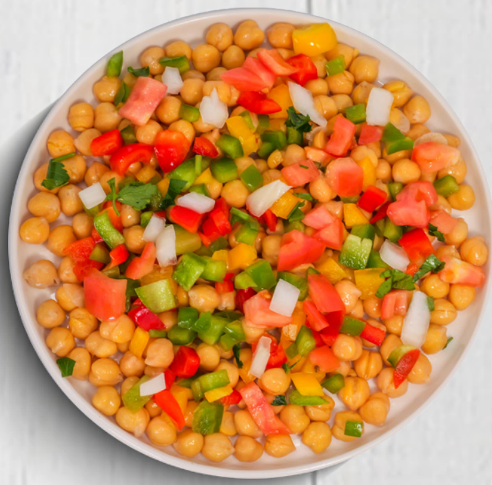
Chickpeas Salad $45.99