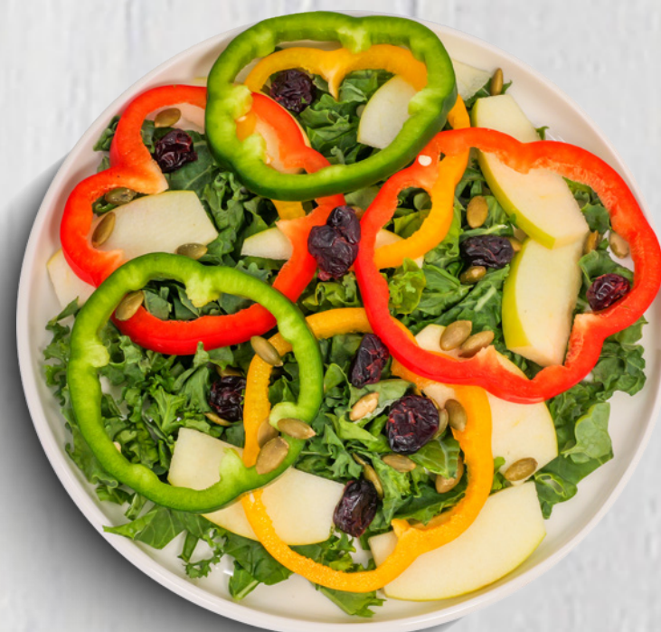
Super Kale Salad $45.99

pictures are for representation purpose only