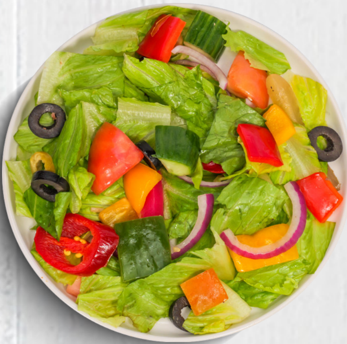
El Greco Salad $45.99