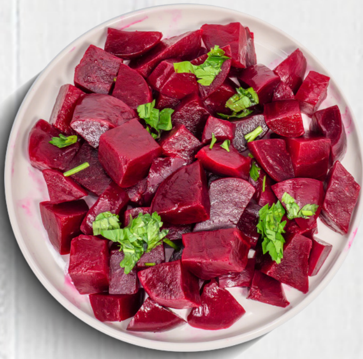
Better beets $45.99