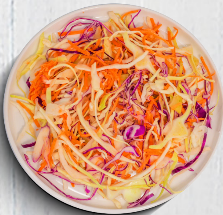
Creamy Coleslaw $45.99