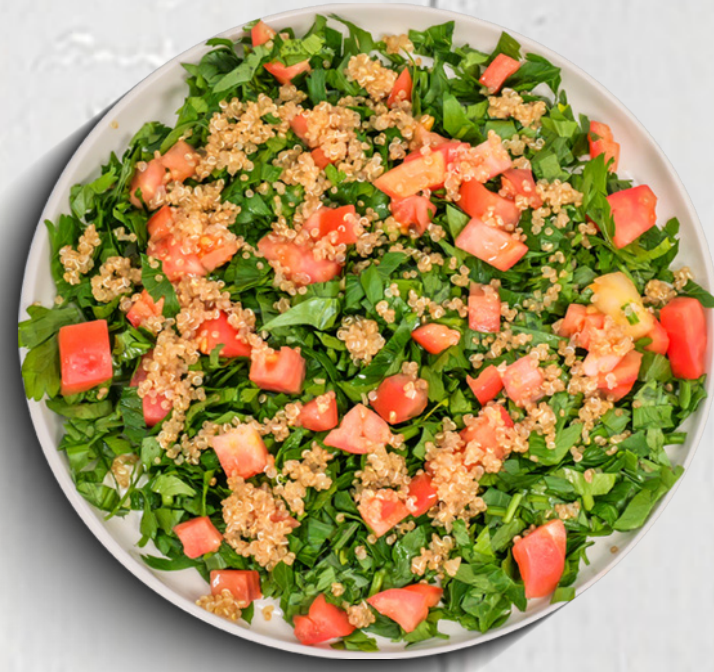
Quinoa Tabbouleh $45.99